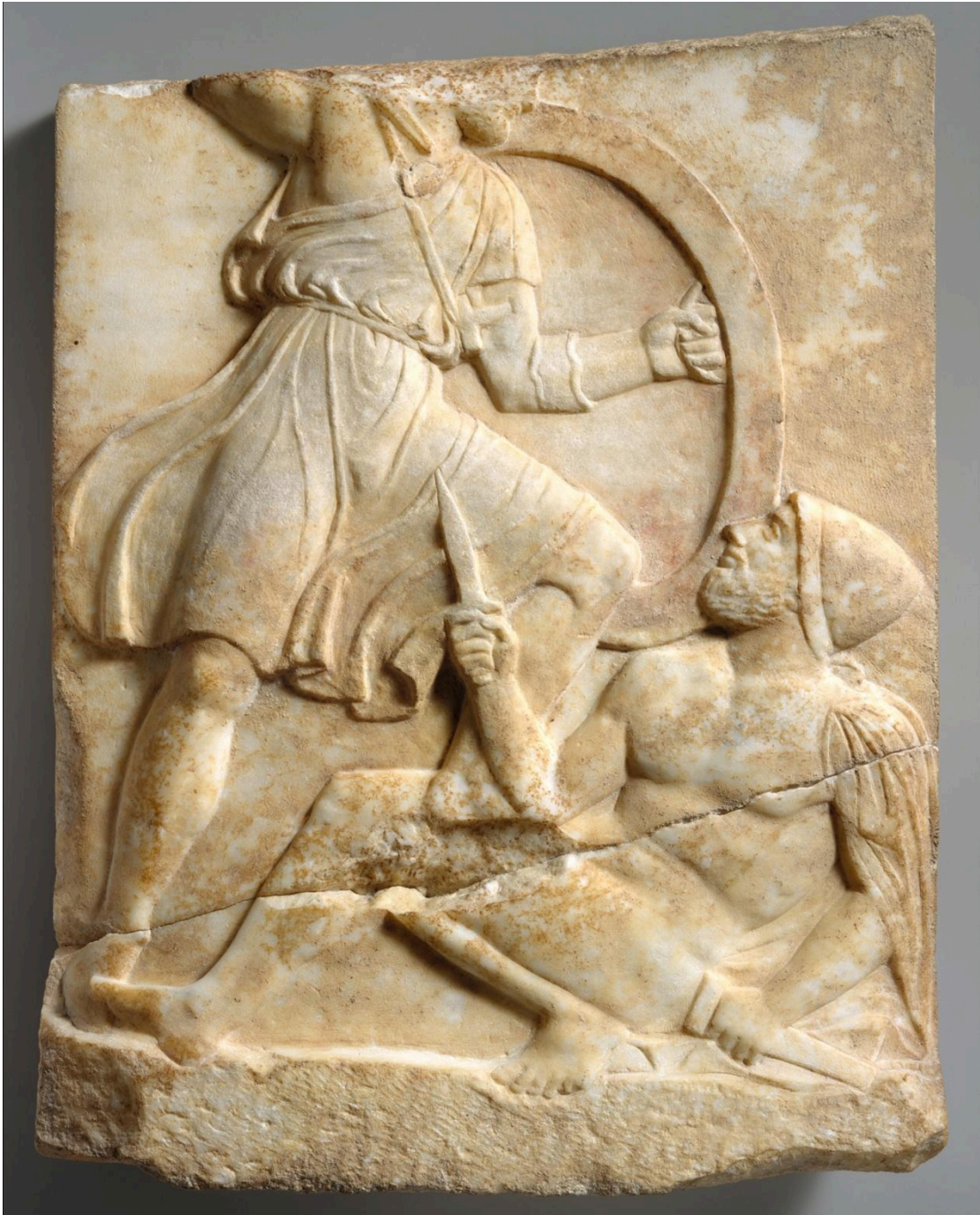
Classical Attic grave stele , c. 390 BCE, depicting a battle scene, New York – Metropolitan Museum of Art, inv. no. 40.11.23