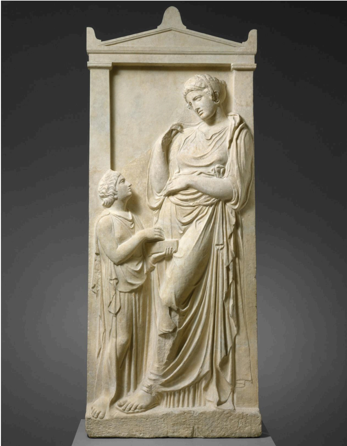
Classical Attic grave stèle , c. 400-390 BCE, depicting the deceased young female with her maidservant, New York – Metropolitan Museum of Art, inv. no. 36.11.1