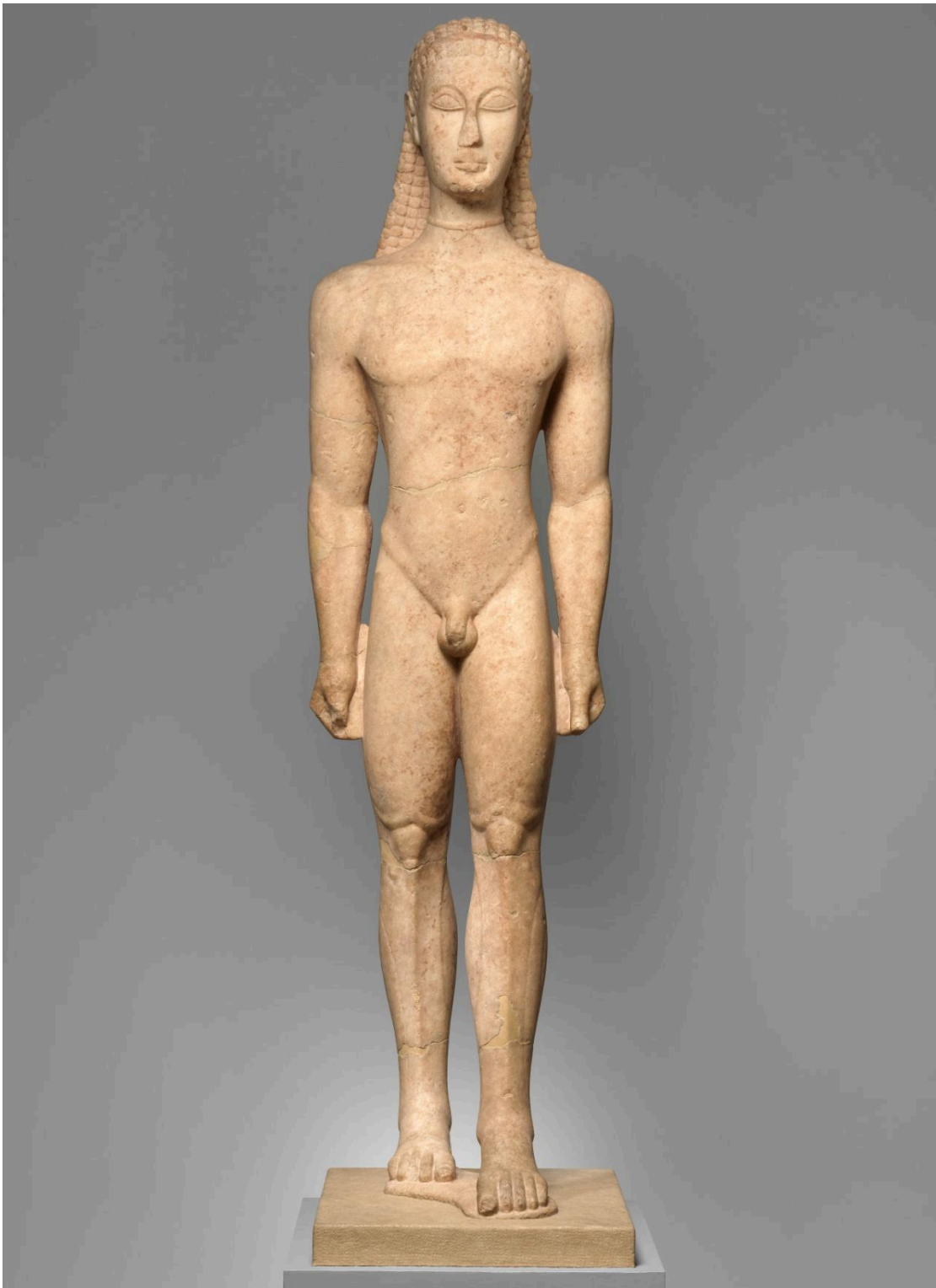
Funerary kouros statue, c. 590-580 BCE, New York – Metropolitan Museum of Art, inv. no. 32.11.1