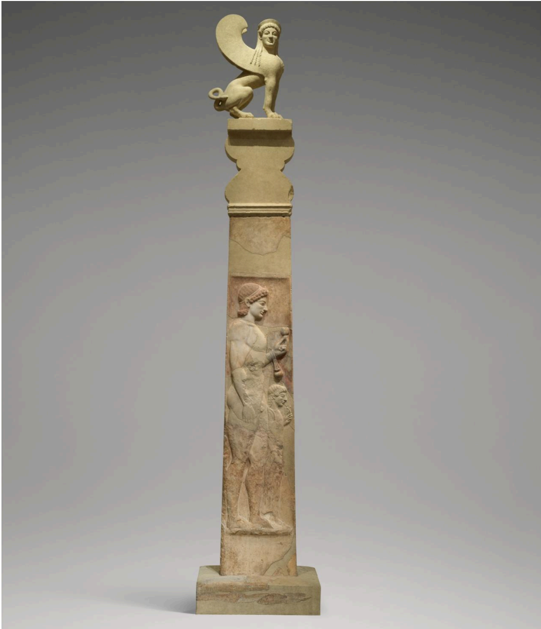
Archaic Attic grave stele crowned by a Sphinx, depicting a youth and his little sister, c. 530 BCE, New York - Metropolitan Museum of Art, inv. no. 11.185a–d, f, g, x